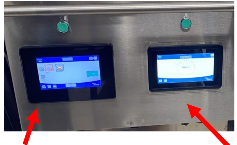
Existing HRCB+ controller (Ultratroniks)

Side By side of the old and new controller