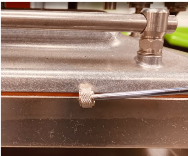
Previous design (up to October 2019)