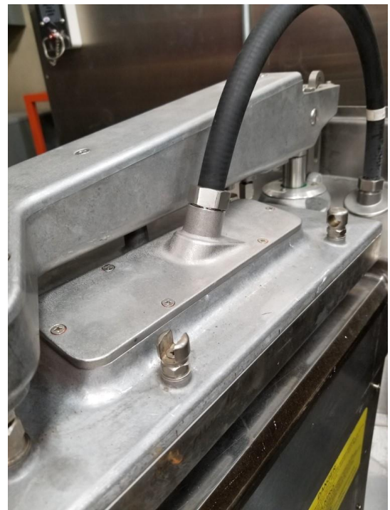
New Hatch and Conduit from 19051001XXXX

Garland will continue to cover damage to the outer covering if repaired with a cold shrink (see bulletin MCD-08-19-ACI 11/19), which should be used if the damaged area is 2" or less (50mm). Failures to the steel inner section as shown in picture will not be covered by warranty as these are caused by excessive strain being placed on the conduit from external forces