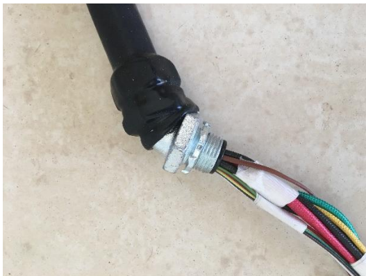
CK4600726 Up to April 2019

When you receive a new design conduit (CK4603291), you will also receive a separate cold shrink sleeve, this will need to be fitted once the conduit has been fitted into the access hatch. The cold shrink sleeve will allow you to tighten the conduit nut to the access the hatch cover. This would not be possible if the cold shrink is pre-fitted.