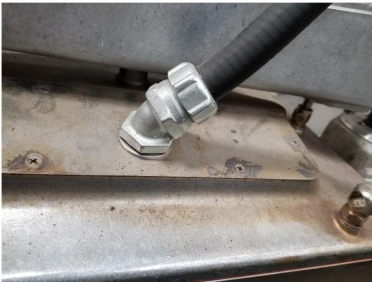
Old Hatch and conduit up to 19041001XXXX