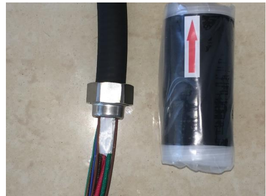
CK4603291 From May 2019