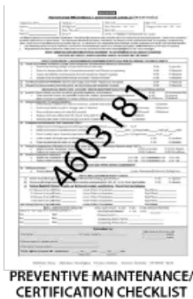
PREVENTIVE MAINTENANCE/CERTIFICATION CHECKLIST