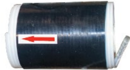
4604306:TUBING SILICONE COLD SHRINK 70 MM