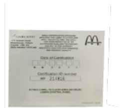
4518261 : LABEL CERT. ROW