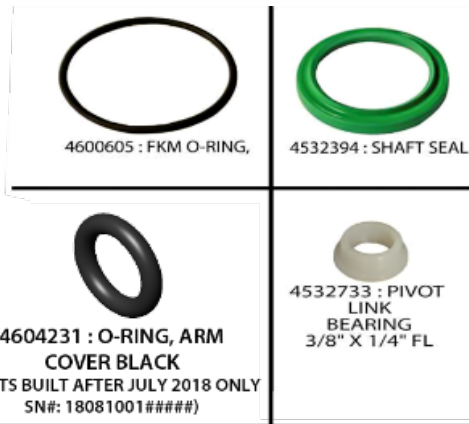
4600605 : FKM O-RING,