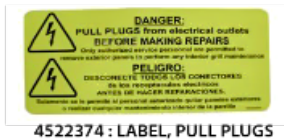
4522374 : LABEL, PULL PLUGS