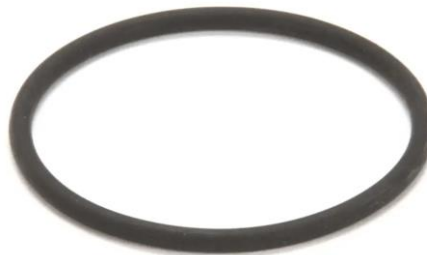
Part # 4600605 - O-ring, Seal cap to Shaft Tube