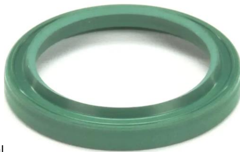
Part # 4532394 – Shaft Seal