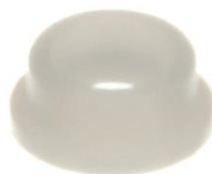
Part # 4532733 - Pivot Link Bearing 3/8"X1/4"