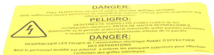
Part # 4522374 – Label, Pull Plugs