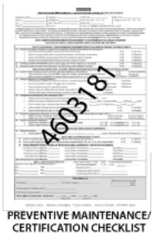
PREVENTIVE MAINTENANCE/CERTIFICATION CHECKLIST