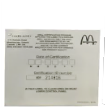
4518261 : LABEL CERT. ROW